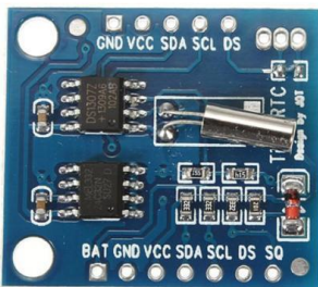
Reloj tiempo real AT24C32