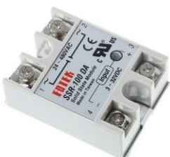
Relay solido 24v